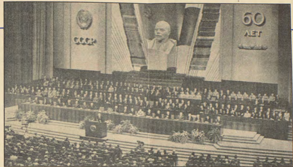
Repeated Western aid has helped to build Soviet credibility.

Successive administrations in Washington have signed U.S.-USSR disarmament treaties and the Soviets have broken every one — to their distinct advantage. American taxpayers financed the construction of the huge Kama River truck factory in the heart of the Soviet Union, and the Soviets used the trucks to invade neighboring Afghanistan. In 1982, when the Soviet satellite government in Poland was about to default on loans supplied by the U.S. government, the Reagan Administration cancelled the debt, even breaking existing law to do so.