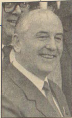
Gorbachev grows when in Moscow, smiles when he addresses the West.

Soviet non-aggression pact of August 1939. Only weeks after signing this treaty, the two arch-criminals sent their troops into hapless Poland and World War II was underway. All the while, however, Hitler was secretly planning a campaign against the Soviet Union, and he sent his armies into Russia in a full-scale assault in June 1941. The Soviets needed help once more.