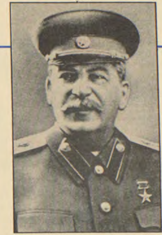
Stalin authored the USSR's "Five Year Plan."

In 1928, Lenin's NEP gave way to Stalin's Five Year Plan. Ford Motor Company built an automo-