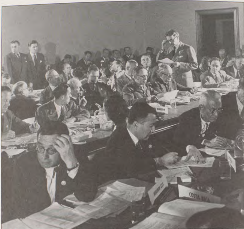
UN's founding conference in San Francisco: From the beginning, the world body was intended to be the formal framework for world government.

"it is fraught with danger to the American people, and to American institutions." (The other opponent of U.S. entry was Republican Senator Henrik Shipstead of Minnesota.)