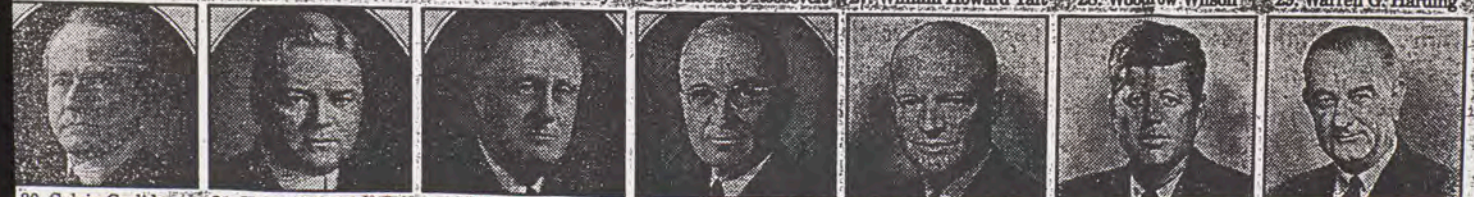
29. Calvin Coolidge 30. Herbert C. Hoover 31. Franklin D. Roosevelt 32. Harry S. Truman 33. Dwight D. Eisenhower 34. John F. Kennedy 35. Lyndon B. Johnson