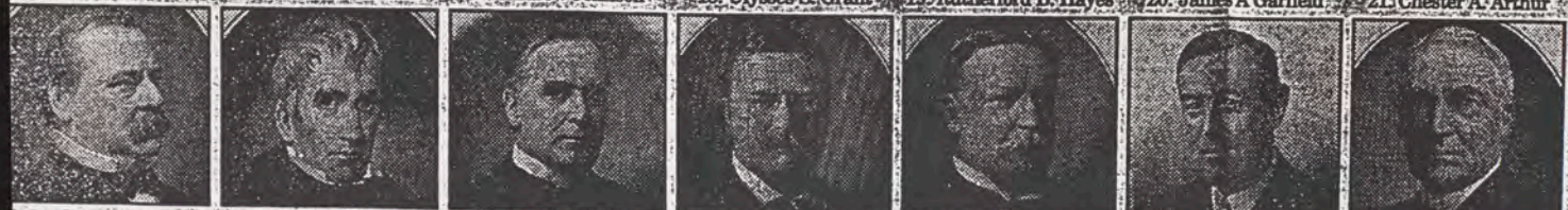
22. Grover Cleveland 23. Benjamin Harrison 24. William McKinley 25. Theodore Roosevelt 26. William Howard Taft 27. Woodrow Wilson 28. Warren G. Harding