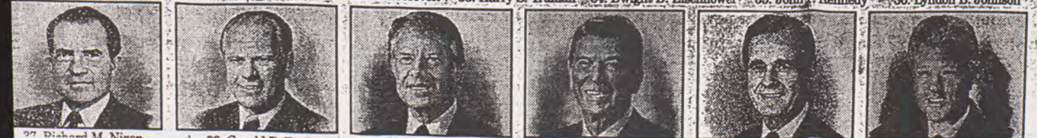
36. Richard M. Nixon 37. Gerald R. Ford 38. Jimmy Carter 39. Ronald Reagan 40. George H. W. Bush 41. Bill Clinton