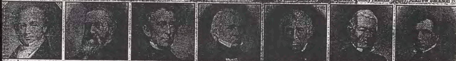
8. Martin Van Buren 9. William Henry Harrison 10. John Tyler 11. James K. Polk 12. Zachary Taylor 13. Millard Fillmore 14. Franklin Pierce