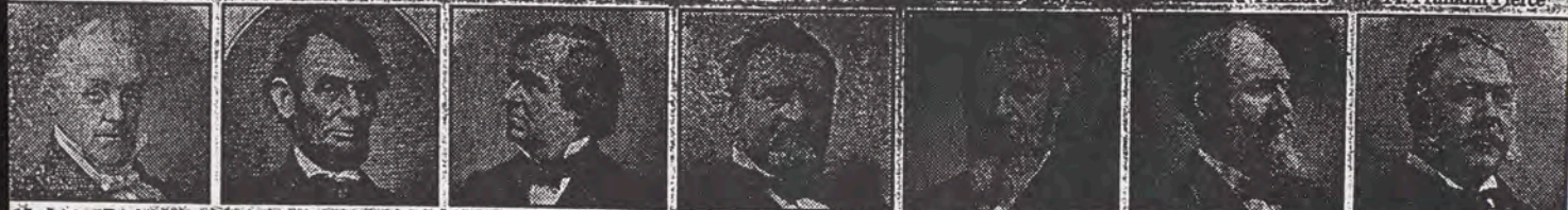
15. James Buchanan 16. Abraham Lincoln 17. Andrew Johnson 18. Ulysses S. Grant 19. Rutherford B. Hayes 20. James A. Garfield 21. Chester A. Arthur