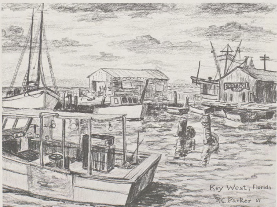
Key West, Florida