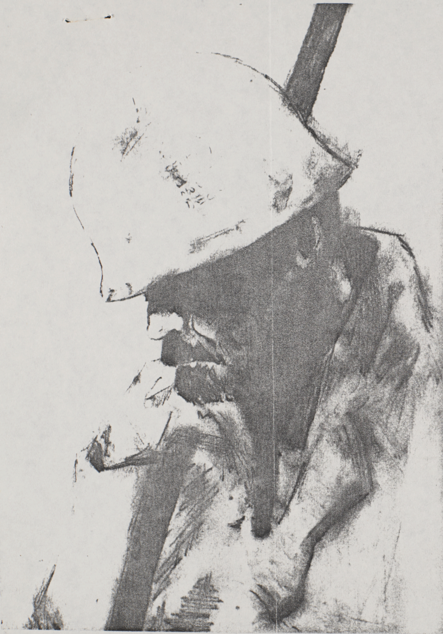
THE UNKNOWN SOLDIER

WE'LL FORGIVE CLINTON'S DRAFT- DODGING AND ANTI- WAR PROTESTING, WHEN THE JEWS FORGIVE HITLER FOR THE HOLOCAUST!!!