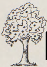
Tracing The "Wood Apple" Tree