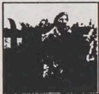
The Story of a Combat Nurse During World War II