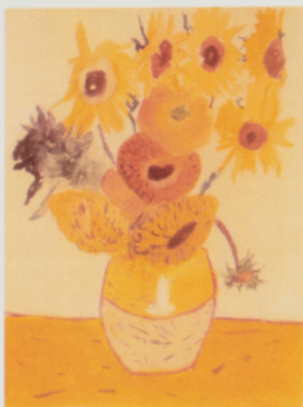
Terezin image, by Edith Dita Polachova

Nearly 10,000 children passed through Terezin. The community saw to it that their education continued with a rigorous daily routine of classes, athletic activities, and art. They painted pictures and wrote poetry. By war's end, only about 1,600 of these children survived.