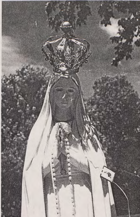
To be victorious against the militant atheists' plot to enslave us in the New World Order we must realize that God has reserved this final victory to those who fight for Him under the banner of His Most Holy Mother Who will crush the serpent's (Satan's) head. ( Genesis 3:15).

"He also forced everyone, small and great, rich and poor, free and slave, to receive a mark on his right hand or on his forehead, so that no one could buy or sell unless he had the mark, which is the name of the beast or the number of his name ... His number is 666." Apocalypse 13:16-18