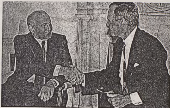
George Bush and Mikhail Gorbachev both want to impose on all of us the one world government New World Order. Read this article to find out how terrible that is.

The proliferation of extraordinary computer technology and other high tech devices is making it possible for a socialistic US government to monitor all aspects (financial and personal) of the American peoples' lives, to abolish privacy, and within a very few years to totally control the people.