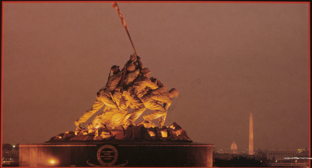
IWO JIMA MEMORIAL