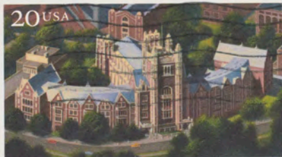
The City College of New York • CUNY • 150TH ANNIVERSARY