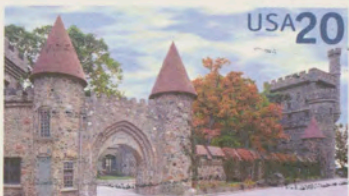
Brandeis University Usen Castle

C-SPAN 400 NORTH CAPITOL ST. NW SUITE 650 WASHINGTON, DC 20001