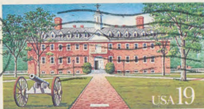
Wren Building, College of William & Mary

C-Span 400 N Capital St - #650 Washington, D. C. 20001