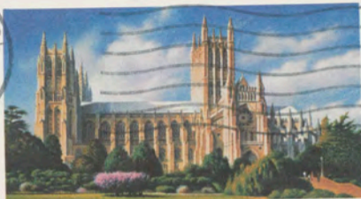
Washington National Cathedral USA19

C-Span Wednesday 05-19-93 400 North CAPITOL STREET #650 N.W.