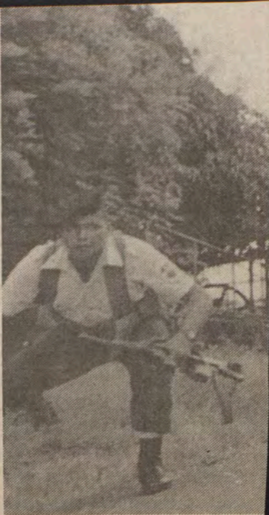
A member of the Nicaraguan National Opposition Union house in Managua.